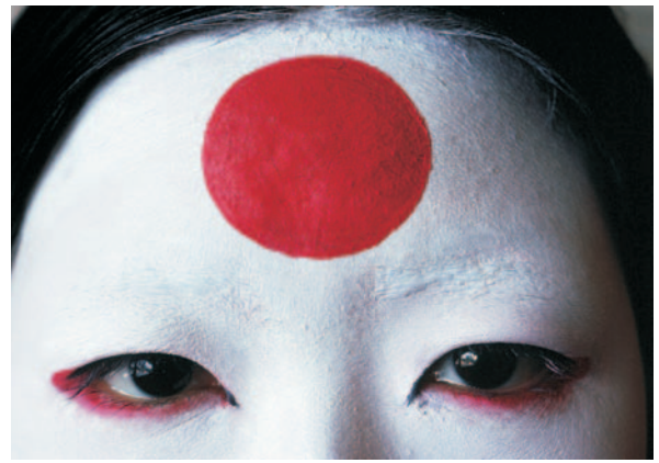
'Japanese Face'

Dye-based HP Vivera inks provide rich color depth, minimal dot visibility, and uniform gloss-all important attributes of image quality.