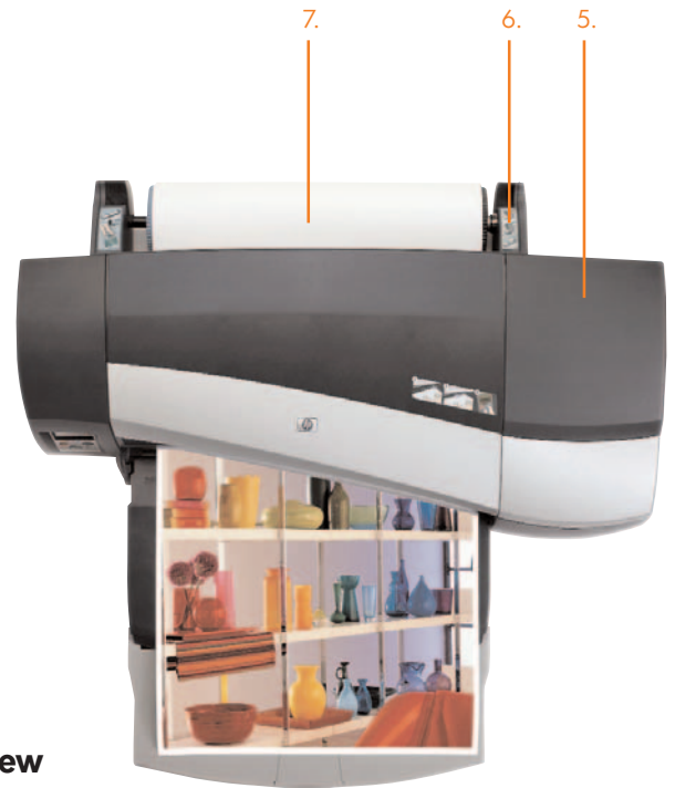
HP Designjet 90r Printer top view